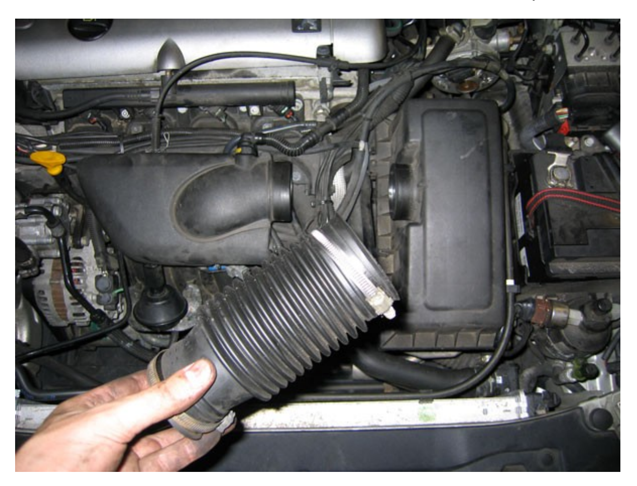
2. Take the cover from the throttle body:

1. Remove the rubber hose between the air filter and the throttle body: