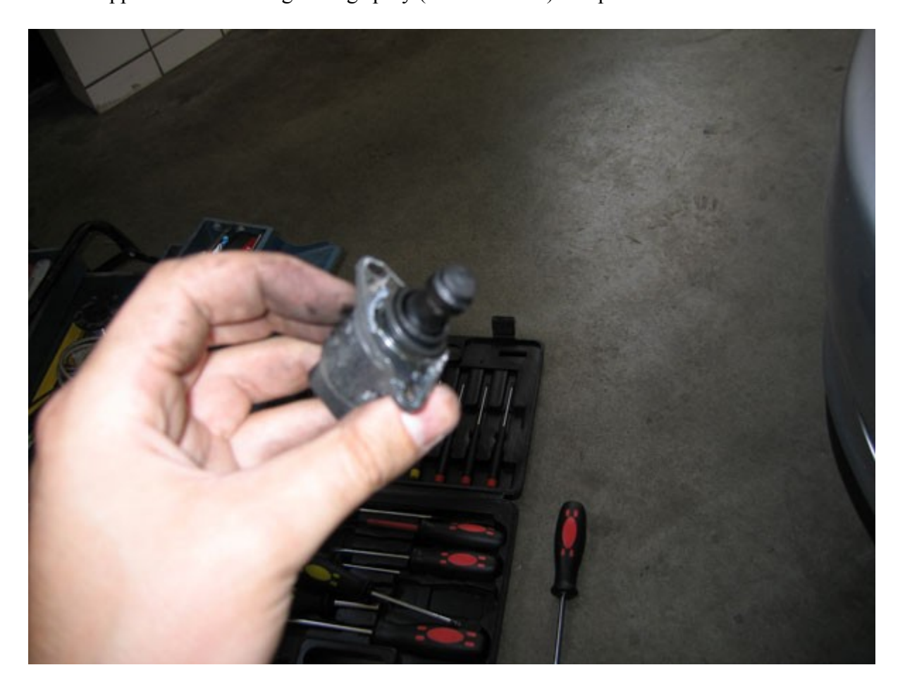
6. Be careful that you don't loose the spring inside the stepper motor:

5. Clean the stepper motor with degreasing spray (brake cleaner) and put a little WD40 in for lubrification: